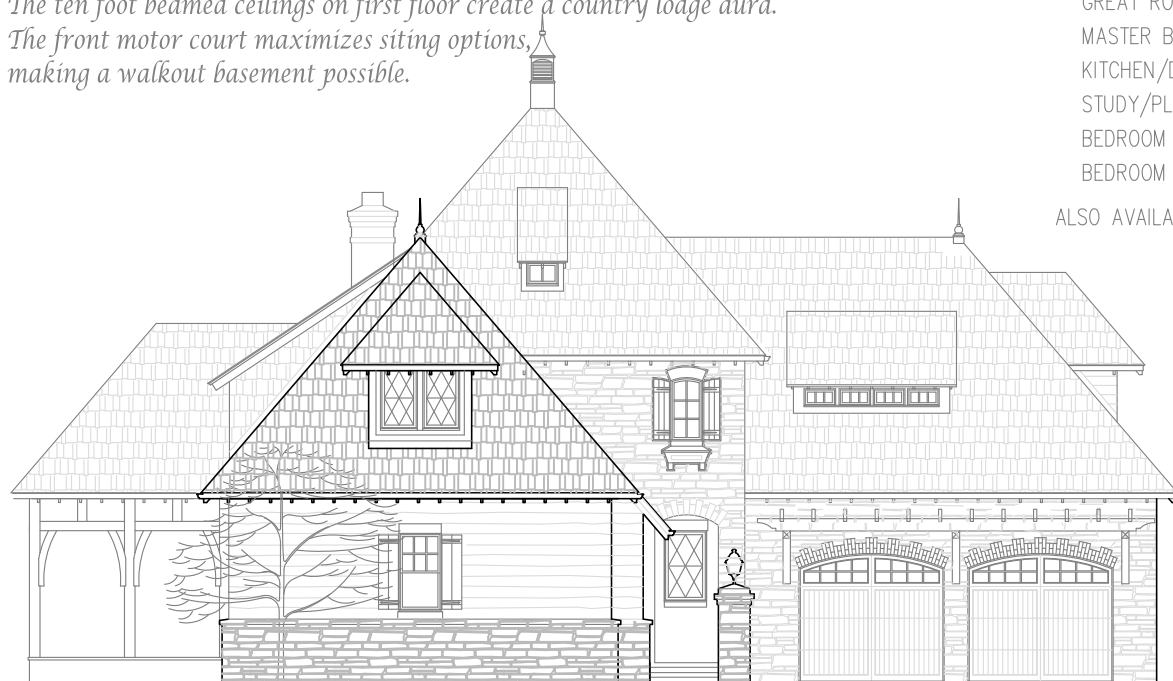
Left Side Elevation

The Surrey Cottage is one of our picturesque cottages specially designed for smaller properties. This home recalls the cottages dotting the English countryside and the beautiful older suburbs around America's cities. See all our cottages on our web site. The ten foot beamed ceilings on first floor create a country lodge aura. The front motor court maximizes siting options, making a walkout basement possible.