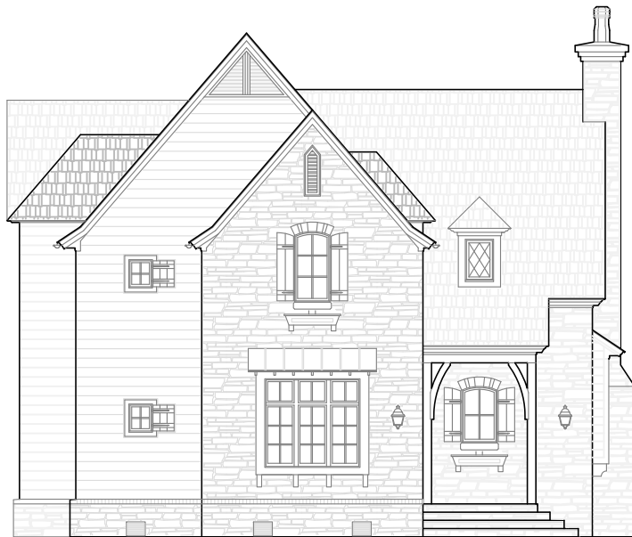
FRONT ELEVATION (FRONT FOR NARROW LOTS)