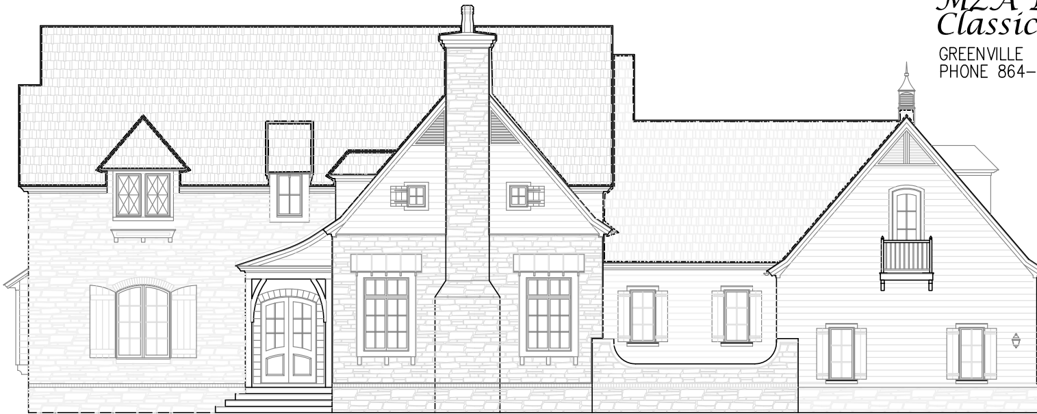
RIGHT SIDE (ALT. FRONT) ELEVATION (FRONT FOR WIDE LOTS)