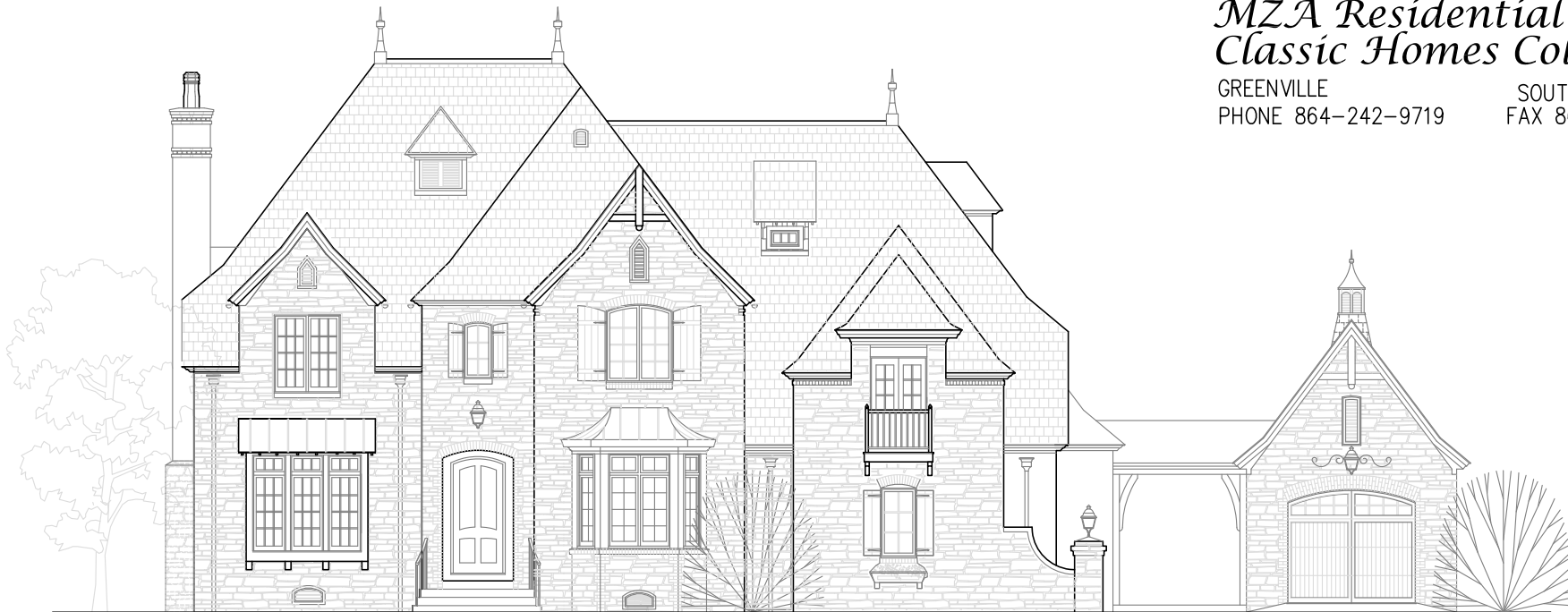
Stone Front Elevation with Optional Garage

The Oldham Manor is one of our larger homes designed in the English Country tradition. Featured on the first floor are 10' and higher beamed ceilings lending an Old World ambiance. The second floor offers a gallery overlooking the family room. Exceptional details throughout create charming living spaces. This stone version would enhance any fine subdivision or countryside; a brick version is also available