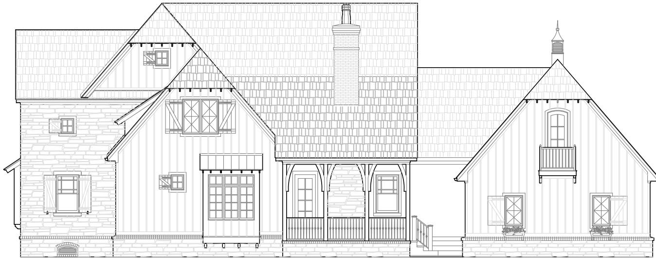
Right Side Elevation

FOOTPRINT 48' WIDE x 83- DEEP FOUR BEDROOMS -3045 S.F. HEATED