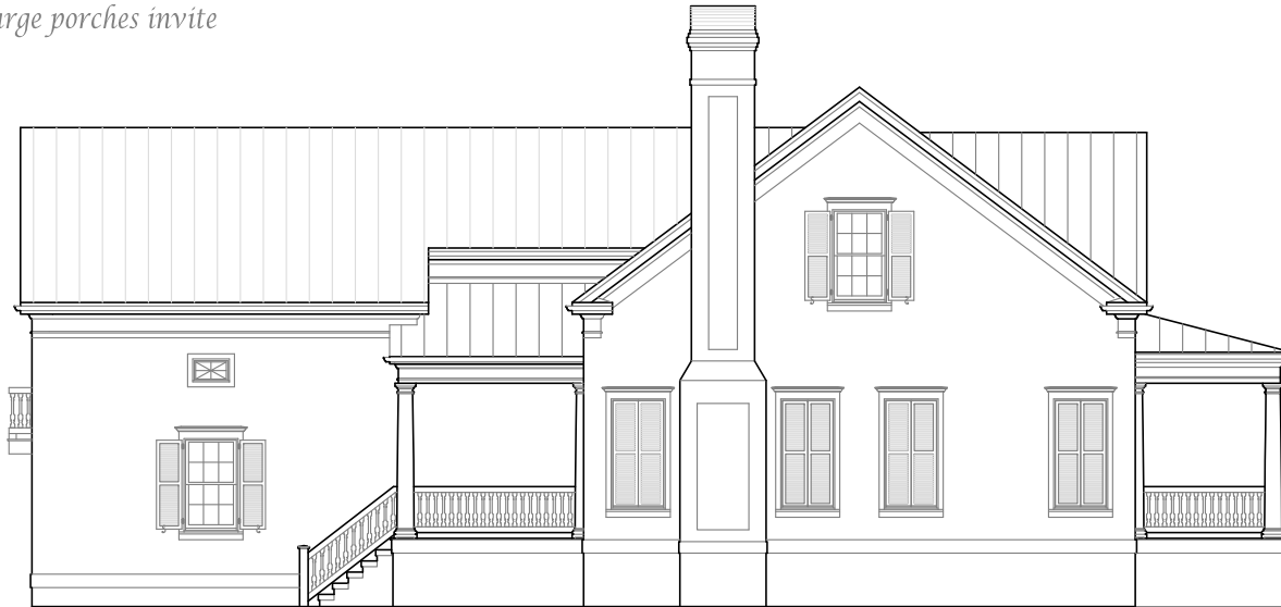
Left Side Elevation

The Natchez Cottage is a small Greek revival reminiscent of the mid to late nineteenth century. This style has remained popular for fine homes large and small throughout the country. Our version in stucco (shown) or siding is designed to fit a 50' wide lot, with rear access, and has a master suite at mid level between first and second floors. The large porches invite you to enjoy all seasons.