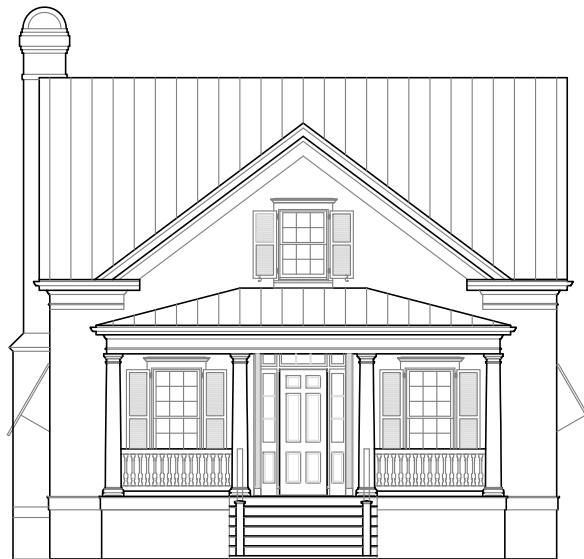
Street Front Elevation

34' WIDE x 73' DEEP HEATED AREA 2411 S/F THREE BEDROOMS 2-1/2 BATHS