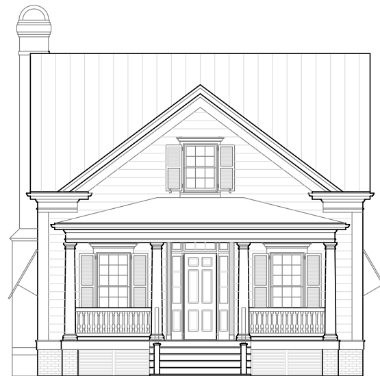
Street Front Elevation

30' WIDE x 71'-6 DEEP (92' W/ GARAGE) HEATED AREA 2176 S/F THREE BEDROOMS 2-1/2 BATHS